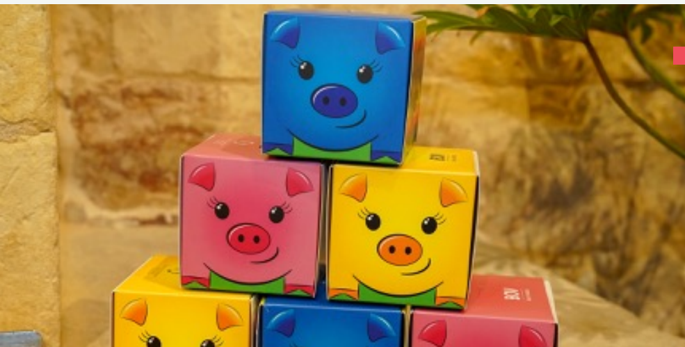
L-ISTRINA BOV PIGGY BANK CAMPAIGN 2020